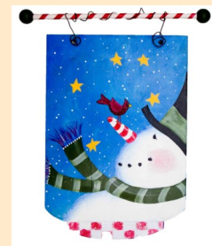
Sweet snowman that we will be painting!!!

list names and ages of all children attending.